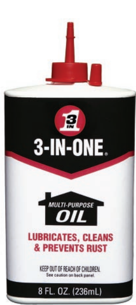
10138 8 OZ. 12 BOTTLES