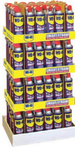
10425 12 OZ. HALF-STACK 12 OZ./96 CANS