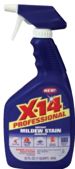
260800 MILDEW STAIN REMOVER PRO 32 OZ./12 BOTTLES