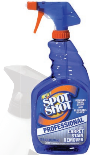
009729 SPOT SHOT PROFESSIONAL TRIGGER 32 OZ./12 BOTTLES