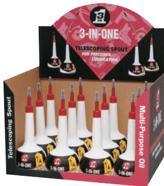
10134 4 OZ. COUNTER DISPLAY 4 OZ./12 UNITS