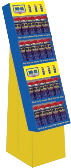
10315 SMART STRAW FLOORSTAND/SIDEKICK 12 OZ./40 CANS