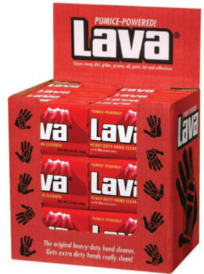
10185 5.75 OZ. BAR 24 BARS IN PDQ