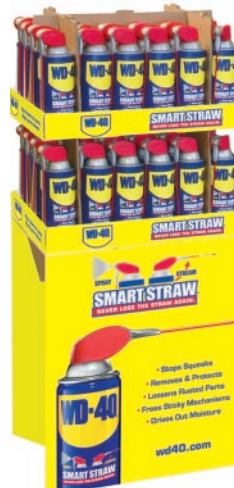
110075 11 OZ. PRE-PACK 11 OZ./48 CANS