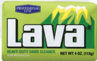
10383 4 OZ. PROFESSIONAL BAR 48 BARS

LOW COST PER HANDWASHING makes Lava ideal for commercial, industrial and janitorial services.