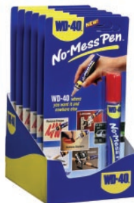
10175 NO-MESS PEN COUNTER DISPLAY 0.26 FL. OZ./12 PENS