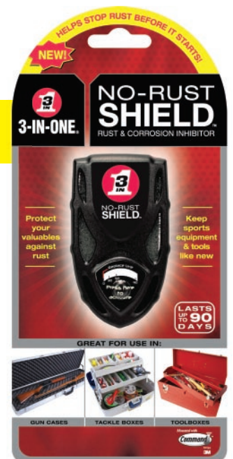
110146 0.7 OZ. 12 UNITS