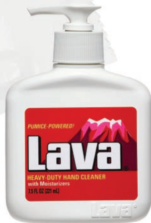
10187 7.5 FL. OZ. PUMP 12 BOTTLES