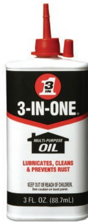
10135 3 OZ. 24 BOTTLES