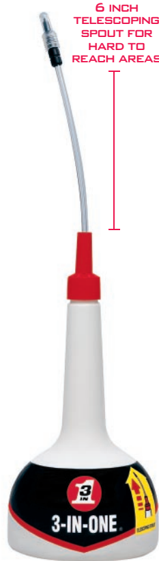
10134 4 OZ. 12 BOTTLES

3-IN-ONE Oil offers precise application solutions to treat tools, equipment and appliances. It lubricates, cleans and protects against rust and corrosion.