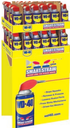
110058 8 OZ. PRE-PACK 8 OZ./48 CANS