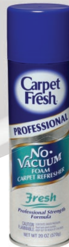
280300 PROFESSIONAL NO-VACUUM FOAM CARPET REFRESHER 20 OZ./12 CANS