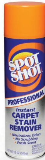
009989 SPOT SHOT AEROSOL PROFESSIONAL 18 OZ./12 CANS