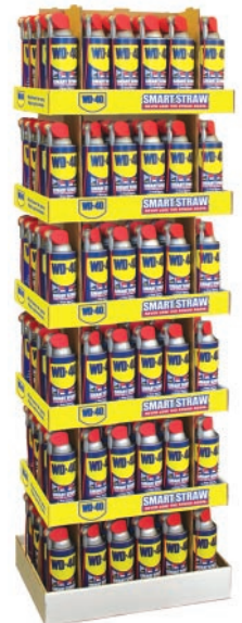
110072 11 OZ. HALF-STACK 11 OZ./144 CANS