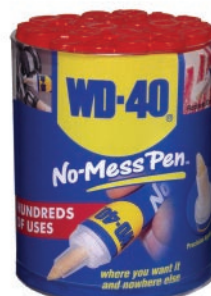
10172 NO-MESS PEN TUB 0.26 FL. OZ./24 PENS