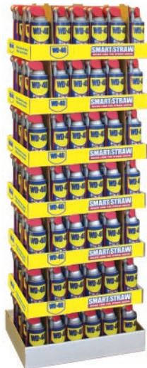
110055 8 OZ. HALF-STACK 8 OZ./168 CANS