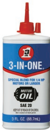
10145 3 OZ. 24 BOTTLES