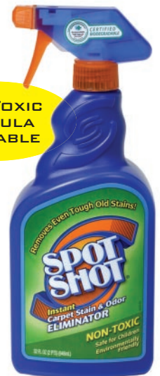
099119 NON-TOXIC SPOT SHOT 32 OZ./6 BOTTLES