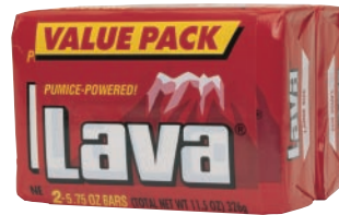
10186 5.75 OZ. BAR TWIN PACK 12 PACKS