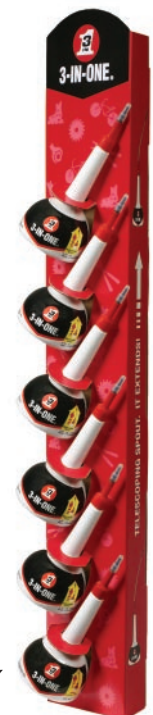
10534 4 OZ. HANGING DISPLAY 4 OZ./12 UNITS