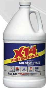
260240 MILDEW STAIN REMOVER PRO GALLON 1 GALLON/4 BOTTLES